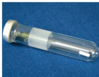
Microwave Vials 2-5 mL