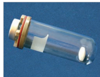
Microwave Vials 10-20 mL (only with EXP systems)

Biotage® high precision microwave vials are engineered for durability and safe reactions. All vials are designed to withstand pressures beyond 30 bar, and in a wide range of conditions.