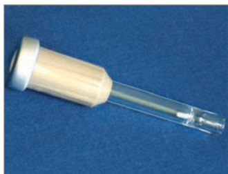
Microwave Vials 0.2-0.5 mL (only with EXP systems)