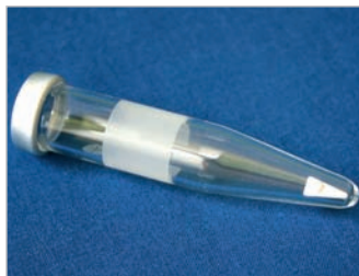
Microwave Vials 0.5-2 mL