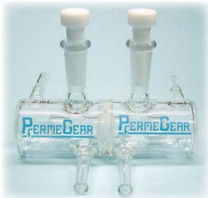
Figure 3, Side-Bi-Side Cell

Prior to using the cell, clean the stirbars and stoppers shown by rinsing them with methanol (MeOH) first and then deionized water several times. Let them dry. Fill both chambers with methanol. Then use a disposable plastic pipette to suck and release methanol from the chamber several times to clean both chambers as well as the contact surfaces of the chambers and the sampling ports. Replace methanol with deionized water. Repeat the previous cleaning step. Finally dry the chambers of each cell in the air before use. Repeat the cleaning procedures after use.