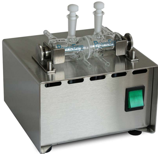
Figure 1 - An H1C magnetic stirrer, Side-Bi-Side Cell, and Cell Clamp

PermeGear's H1 Side-Bi-Side Cell Manual Diffusion System includes one Side-Bi-Side Cell, an H1C Stirrer, and a heater/circulator. Each cell half is surrounded by a "jacket" through which heated water is circulated. A cell clamp securely locates the Side-Bi-Side Cell directly above individual stirrers. H1C Stirrers provide easy access for connecting the jackets to a heater/circulator (not shown in the photo below). PermeGear provides heater/circulators, but often these are already available in the users' labs.